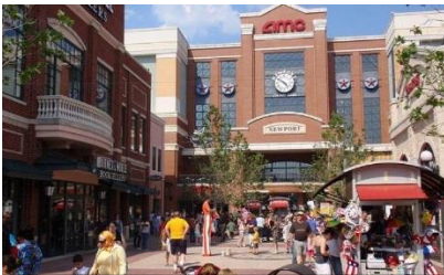
Shopping & dining at Newport on the Levee and Over-the-Rhine